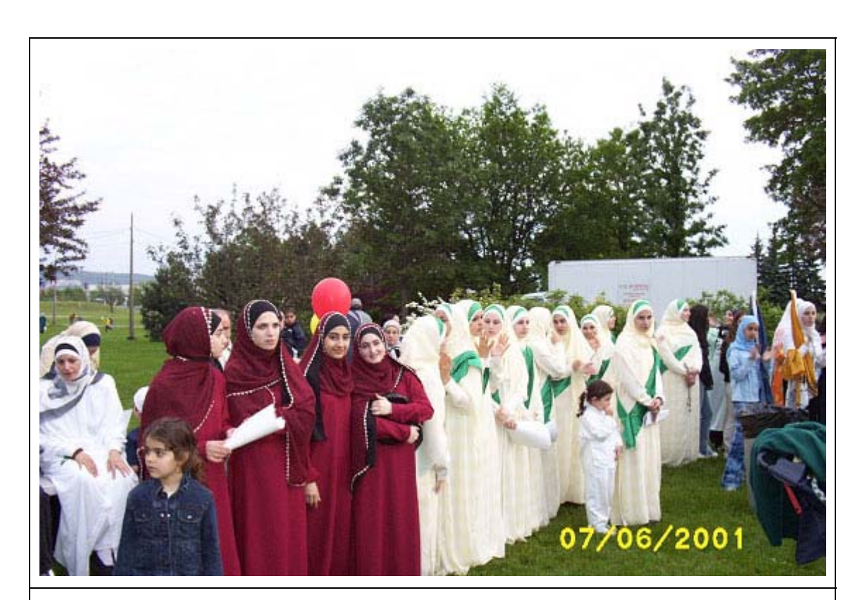
The Women group of Madih in Parc Jarry, Montreal