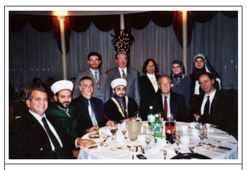
Shaykh & other members with deputies