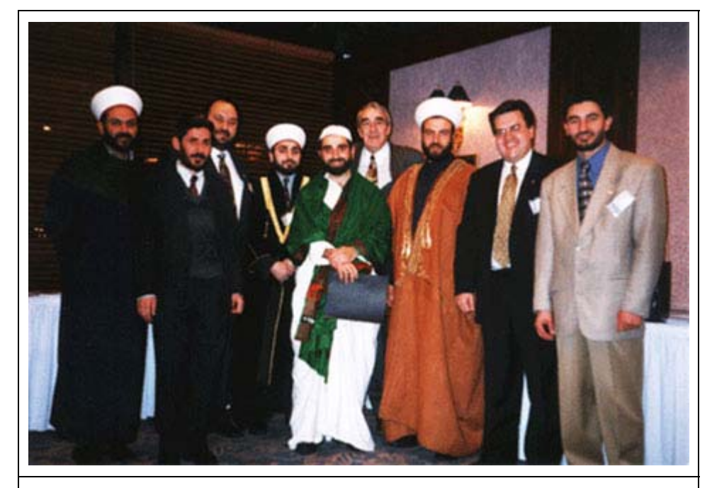
Shaykh (teachers of Islam) with some members of the mosque.

was able to bring my brother twice to the mosque, for him to ask his questions and get to know a little bit more about my new religion.